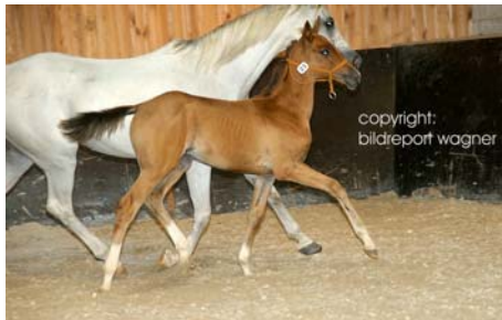
Highest scored foal, Arasien® horse Astrachan

For the first time in the history of the show a free-jumping competition had been scheduled on Saturday evening and was expected excitedly by the enthusiasts. Here, the Akhal-Tekes clearly dominated the Arabian horses. In the finals from 16 entered horses 3 Akhal-Teke stallions delivered themselves an open battle with jumps over 2 meters: Altair from Czechia, Ovoi and Daimir from Germany.