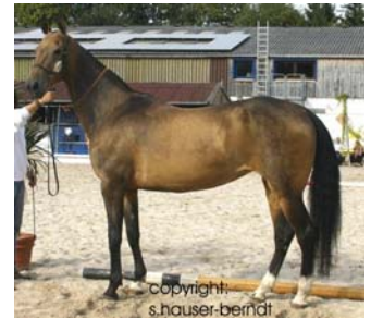
Akhal-Teke champion Merchaba