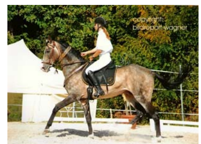
23-year old Parachat in the elite class